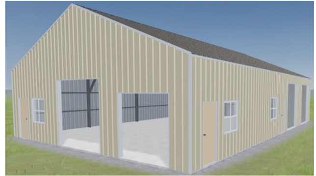
RAPID Steel Buildings are easily designed using online modeling software